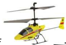
E-flite Blade Micro CX RTF $119.95 Bind & Fly $89.95